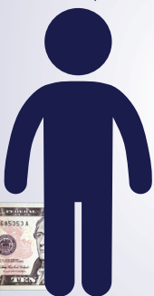
Children enrolled in the Kinship Care Program