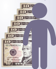
Children in out-of-home care (foster care, group homes and residential treatment)

SOURCE: Kentucky Cabinet for Health and Family Services, Department for Community Based Services, Kinship Care and Foster Care FACTS, November 2013.